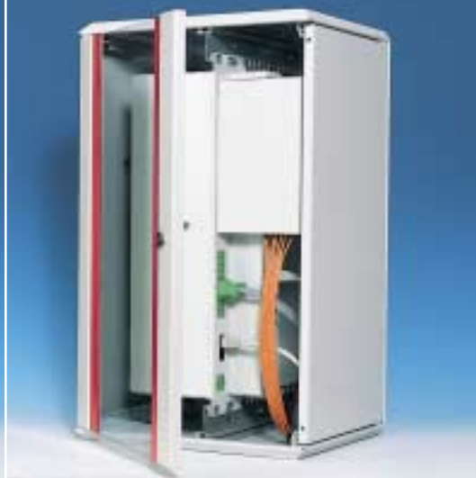
Monitoring station, wired.