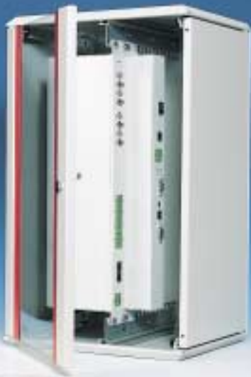
Monitoring station in a cabinet.